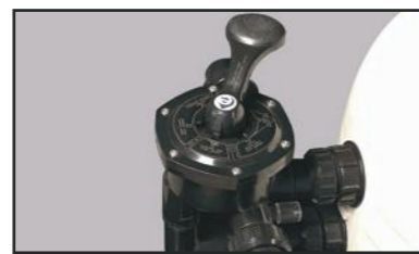
Equipped with a 6-way multiport valve