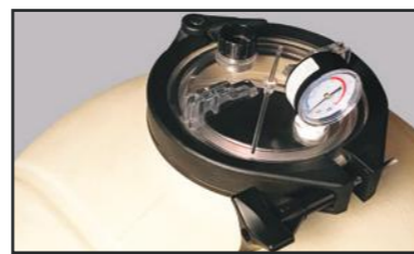
Easy-to-read pressure gauge for inspection